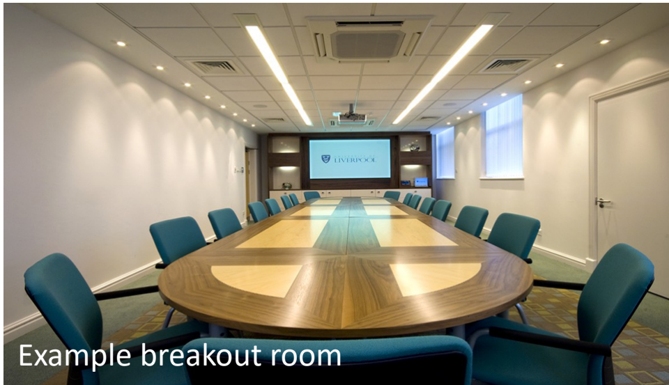
Example breakout room