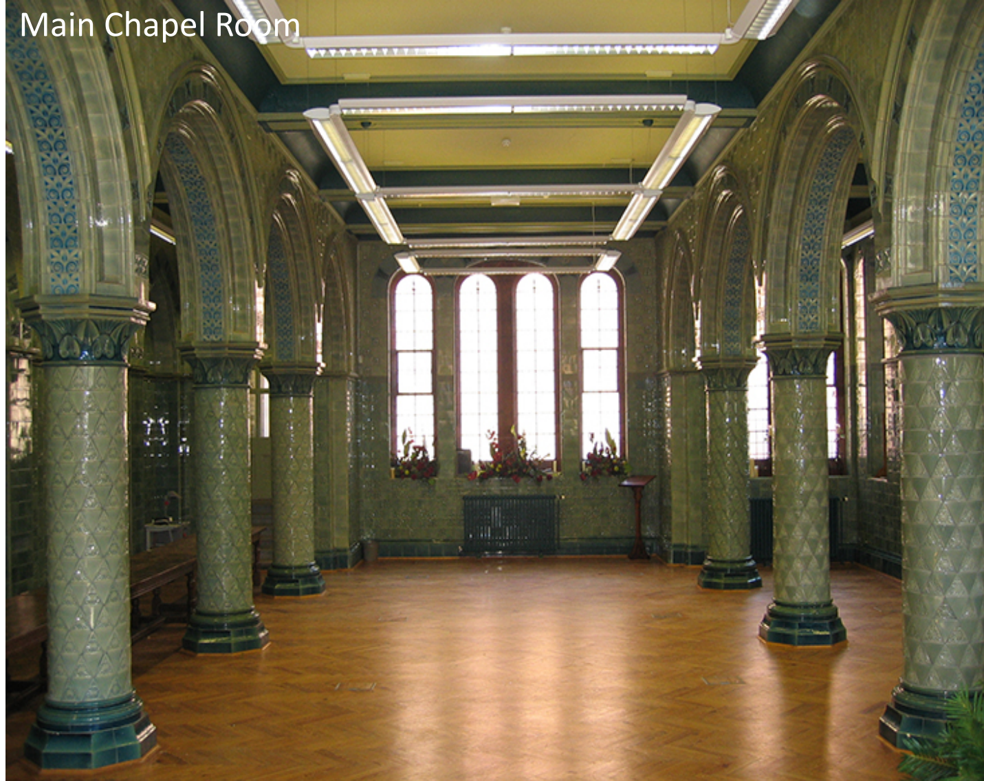
Main Chapel Room