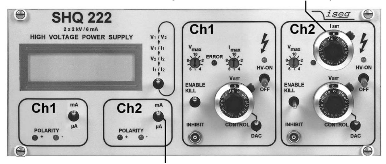
Setting current measurement

Option IWP: Hardware current limit with 10-turn potentiometer